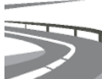
HIGHWAYS & ROAD FAULTS