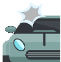
ROAD TRAFFIC COLLISIONS